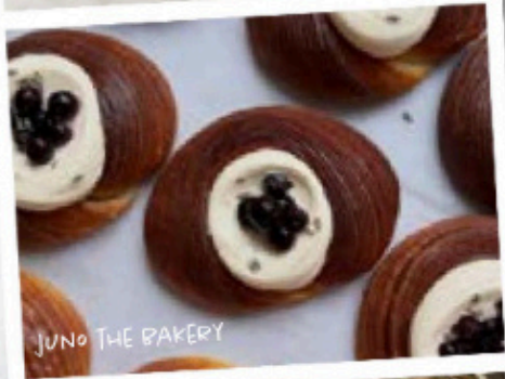
JUNO THE BAKERY