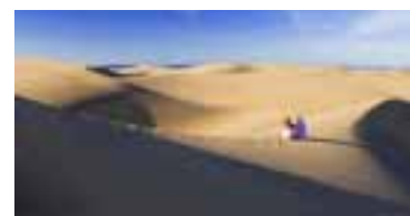
Ayagaures route in Maspalomas in the south coast of the island organised by Free Motion E-Bike Trekking.

I finally climbed back in the saddle by joining the 33km