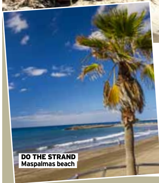
DO THE STRAND Maspalomas beach

ONE of the many things I missed during lockdown and which, alas, isn't coming back, is the daily cycle to work.