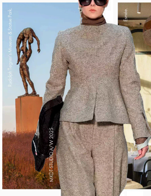
Rudolph Tegner's Museum & Statue Park