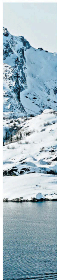
The pretty little settlement of Nusfjord perches between mountains and sea

Remote Nusfjord is an atmospheric yet comfortable outpost in Norway's remote Lofoten Islands. By Megan Murray