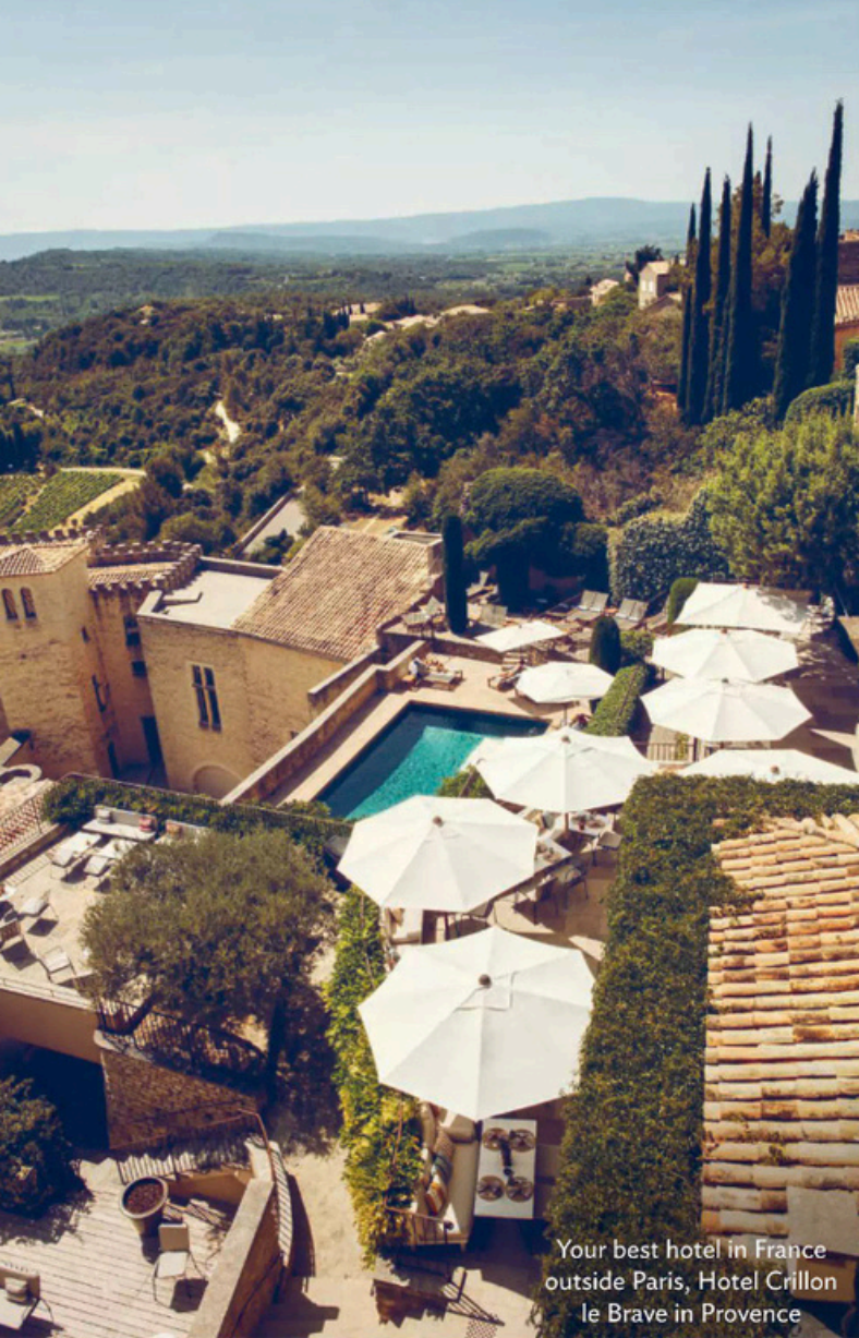
Your best hotel in France outside Paris, Hotel Crillon le Brave in Provence