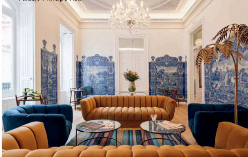
The Portugal winner, Lisbon's Palácio Príncipe Real