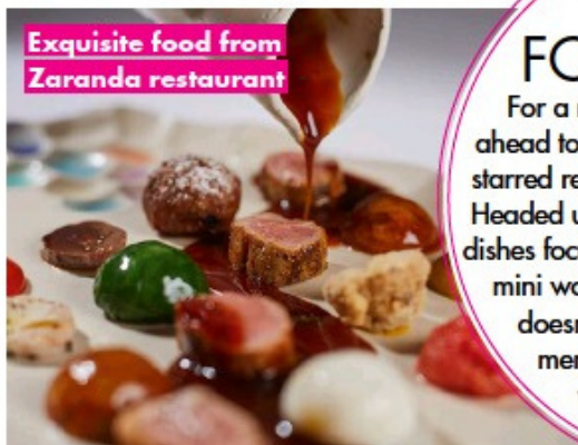
Exquisite food from Zaranda restaurant

For a memorable experience, book ahead to secure a table at two-Michelin-starred restaurant Zaranda ( zaranda.es ). Headed up by chef Fernando P Arellano, dishes focus on local flavours and look like mini works of art. A meal at Zaranda doesn't come cheap, with tasting menus starting at €115, but it will elevate your trip to the unforgettable.