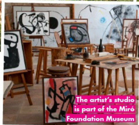
The artist's studio is part of the Miró Foundation Museum

owned by a group of local people, has a more traditional feel, with a smaller plot of land and hand-harvested grapes, which produce delicious bottles of syrah, chardonnay and merlot. Both vineyards can arrange intimate guided tours, where you can learn all about the fascinating process of winemaking before sampling some of the best ones.