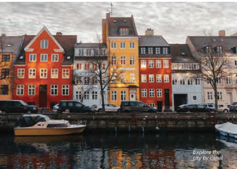
Explore the city by canal