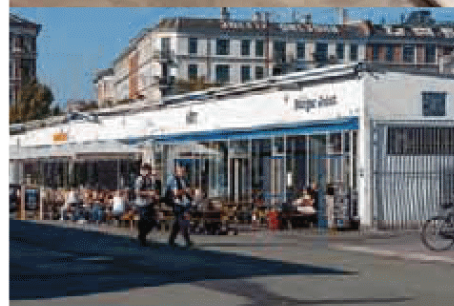
Above: Copenhagen's vibrant dining scene in Kødbyen. Top: Danish furniture design at Designmuseum Danmark