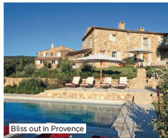
Bliss out in Provence