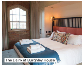
The Dairy at Burghley House

» Luxury and wellbeing united under blue Provençal skies with Red Savannah's new Body Revival, a curated retreat focusing on gut health, nutrition and foraging at private villa La Colline Fleurie. 17-23 September, from £2,680. redsavannah.com