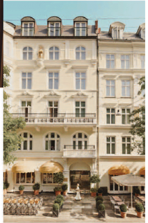
CLOCKWISE FROM TOP LEFT: Barr celebrates North Sea cuisine; Hotel Bella Grande is all understated Italian glamour; The grand old dame was built in 1899; Break into song at Bird; The uptown bar is known for its negronis.