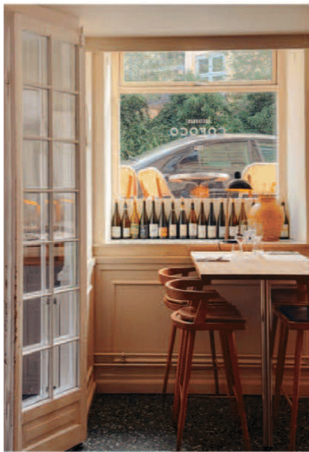
CLOCKWISE FROM ABOVE: Restaurant Cofoco epitomises Copenhagen cool; Nyhavn is the city's 17th-century waterfront; The terraces at Hotel Bella Grande are inspired by Italian piazzas.