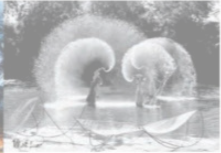
THE WATER FLOWER, MAI LOC